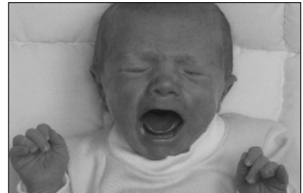
Mothers who abused drugs during pregnancy paid less attention to their infants.

Crack-exposed infants are at further risk because of the effects of the drug.