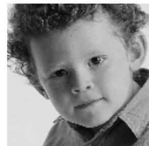
How can you minimize the trauma of placement?

In her 1982 article on parent-child attachment, published in the journal Social Casework , Peg Hess states that three conditions must be present for optimal parent-child attachment to occur: continuity, stability, and mutuality. Continuity involves