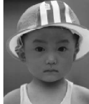
Taking culture into account enhances your ability to engage with families and build on their strengths.

If we fail to acknowledge the influence of culture on the work we do, we limit our ability to interact with and help families and children. Even worse, culturally in-