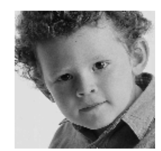
How can you minimize the trauma of placement?

Attachment is a process made up of interactions between a child and his or her primary caregiver. This process begins at birth, helping the child develop intellectually, organize perceptions,