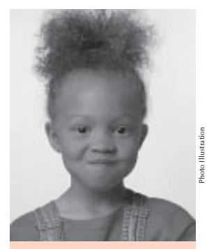
Tracking the success of individual workers helps us keep our "eyes on the prize."

The data, updated monthly and kept over a six-month period, can help a supervisor assess and compare casework practice among his or her unit's workers. For example, do some workers seem to rely heavily on removal and foster care placement? Do others actively seek family participation in planning? Are some workers successfully engaging families so that they want services on a voluntary basis? Do some workers consistently have fewer placement disruptions? Are families allowed greater access to