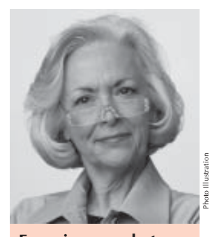
Focusing on what workers don't know and can't do does not teach them to identify and develop strengths in families.

who were part of the family support movement, looked with alarm at the growing number of children in foster